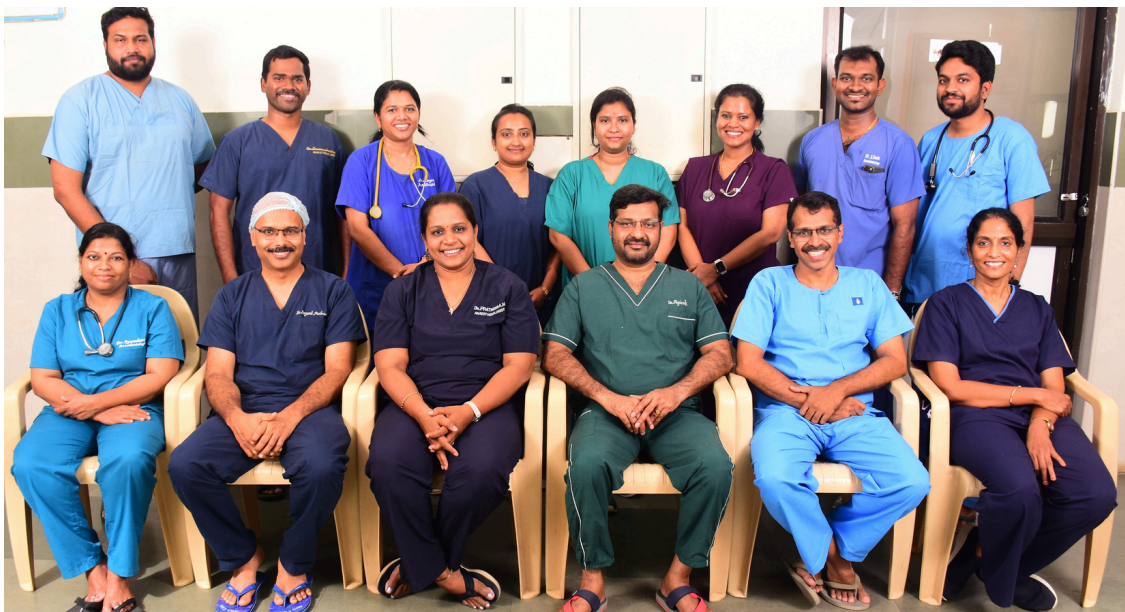
DEPARTMENT OF ANAESTHESIOLOGY IGMC&RI

Nothing is possible without a Team work .